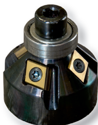
Art. nr. 25401