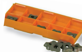
Art. nr. 26109