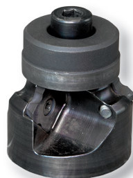
Art. nr. 25402