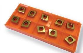
Art. nr. 27231